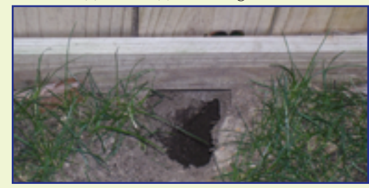
Gnawing: Bite or nibble